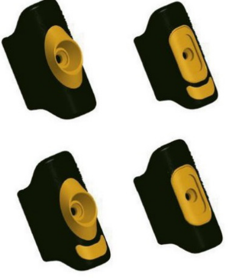
Standard CLIPs Harsh Environment CLIPs

Unlike most contemporary solutions, the Honeywell CLIP Hole Identification System is installation-ready (with no need for assembly, any additional parts or tools); CLIPs are provided as a single ready-to-fit piece. Honeywell's CLIPS are also available in two formats; Standard and Harsh Environments. Harsh environment CLIP variants feature a flexi-lip design that changes its shape when subjected to blow off pressure. This ensures that any ice, fiber or dust build-up on the supporting rubber structure can be easily detached and broken up by the air Jetstream out of the CLIP hole, providing additional protection in challenging locations like freezer applications.